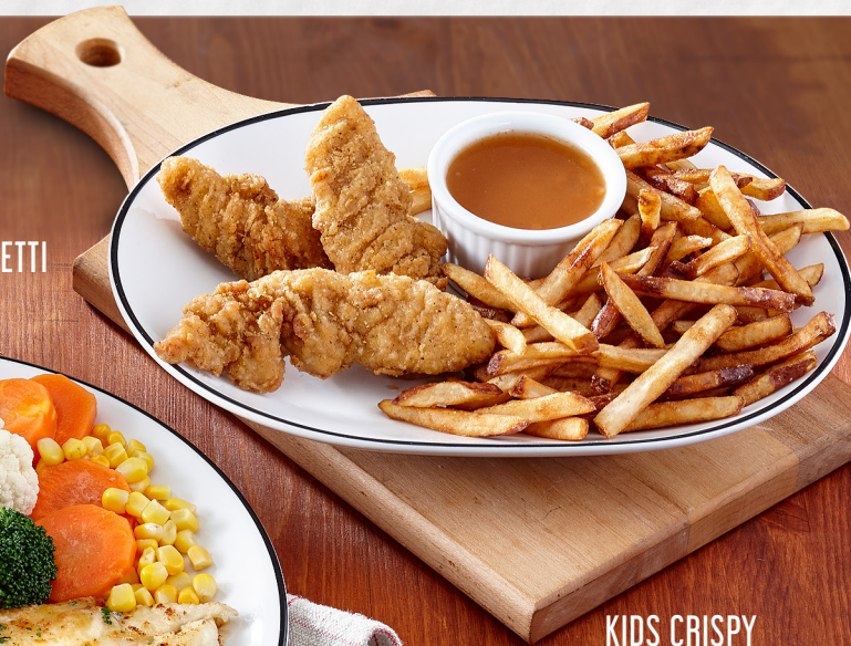
KIDS CRISPY CHICKEN FINGERS