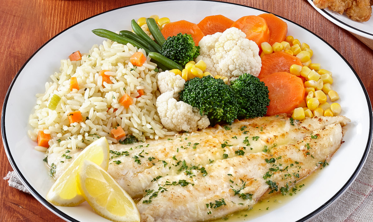
FILLET OF SOLE