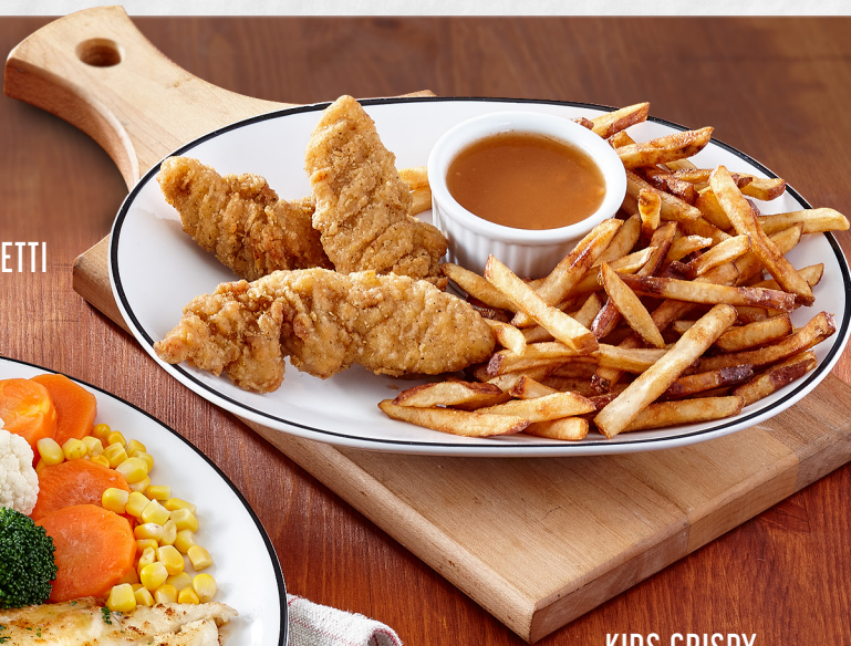
KIDS CRISPY CHICKEN FINGERS