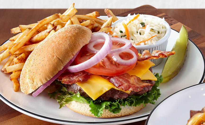
JIMMY DEAN HAMBURGER

Fries, cheese curds and bolognese sauce.