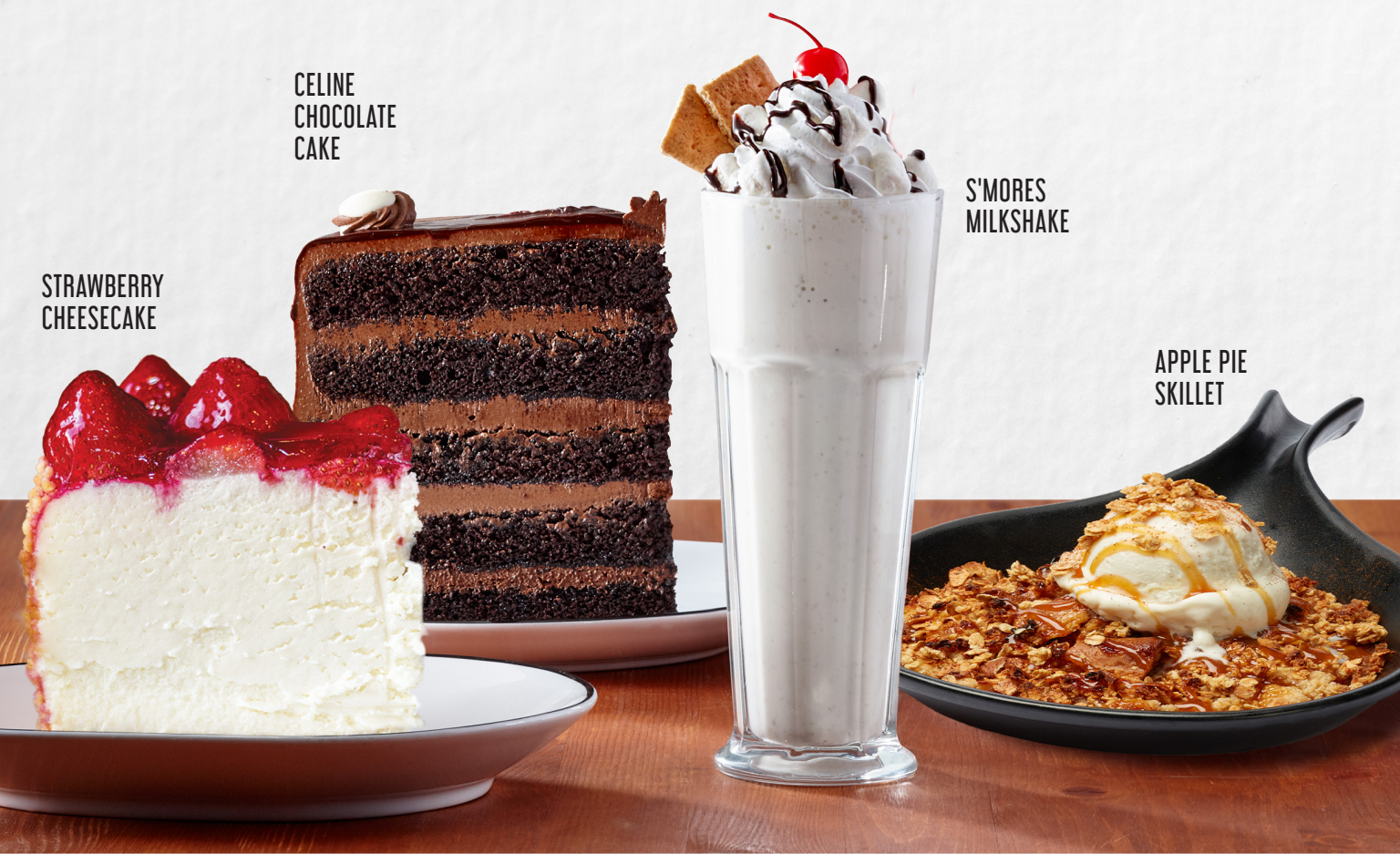
CELINE CHOCOLATE CAKE

Your choice of chocolate, vanilla or strawberry.