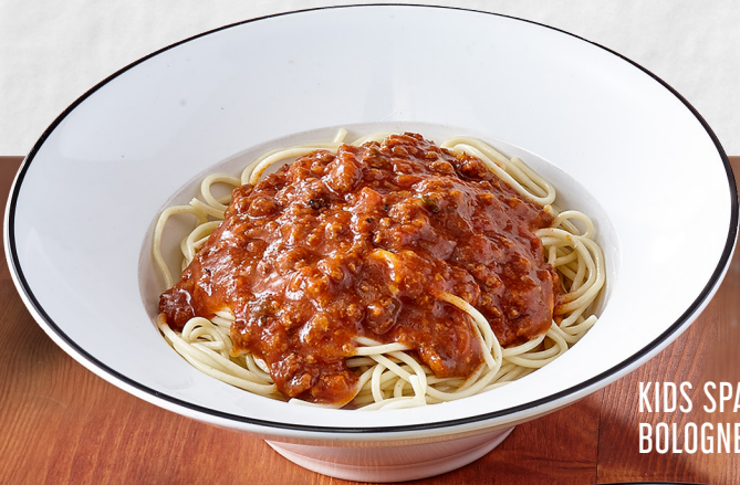
KIDS SPAGHETTI BOLOGNESE

Tomato and lettuce. Served with French fries.